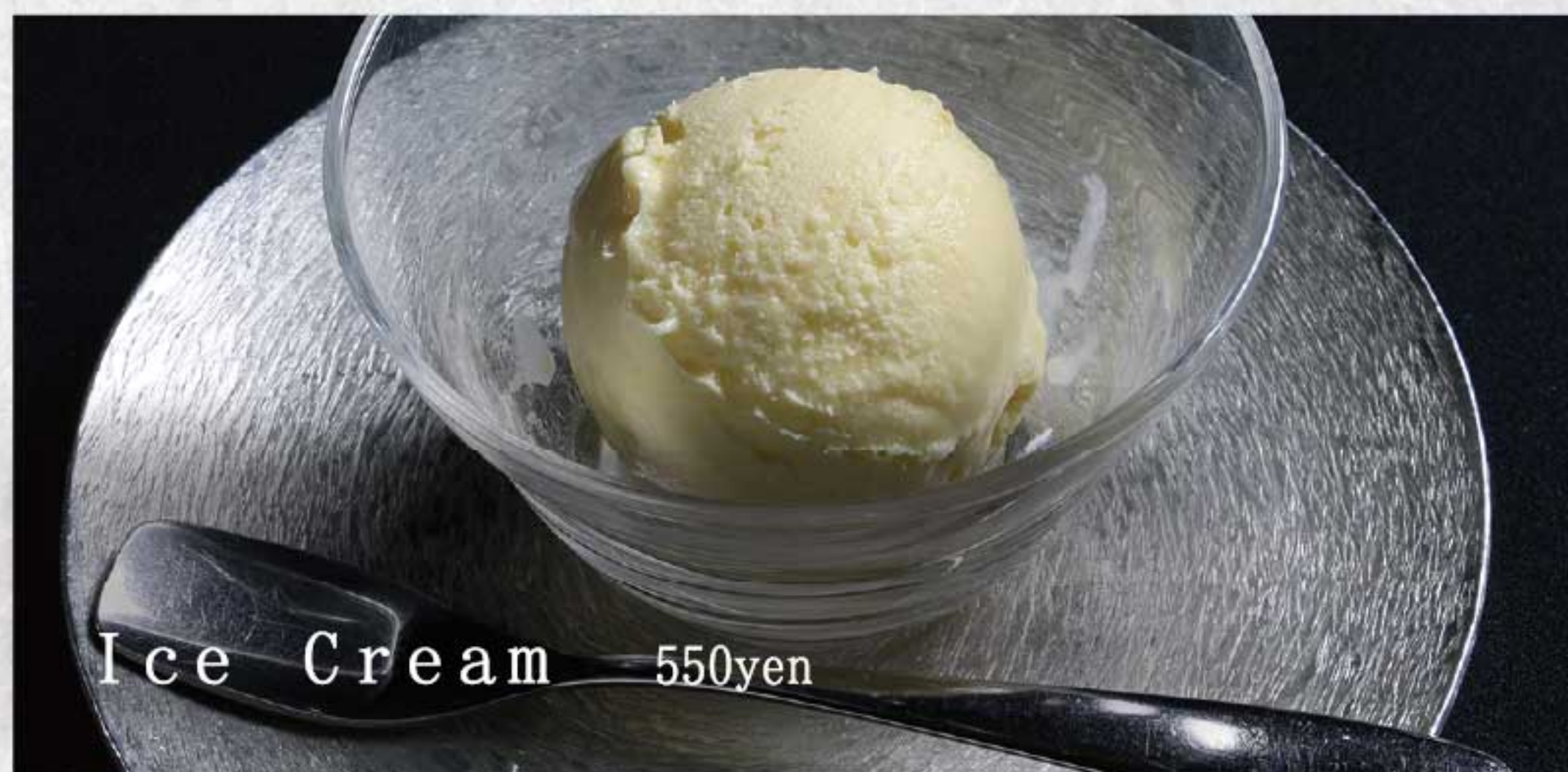
Ice Cream 550yen