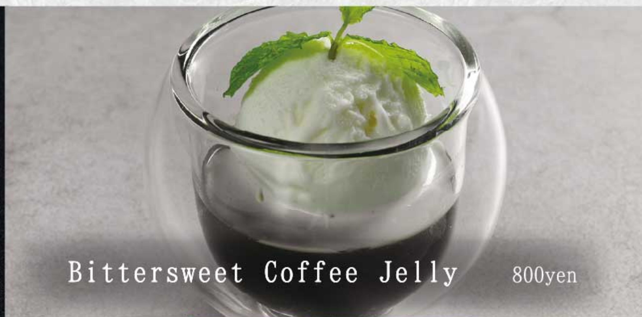
Bittersweet Coffee Jelly 800yen