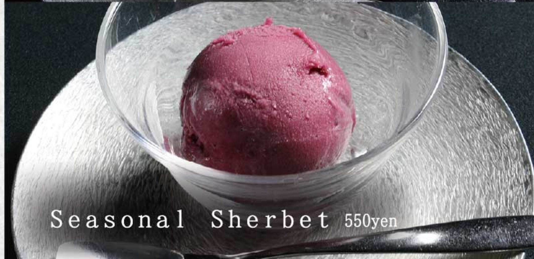
Seasonal Sherbet 550yen