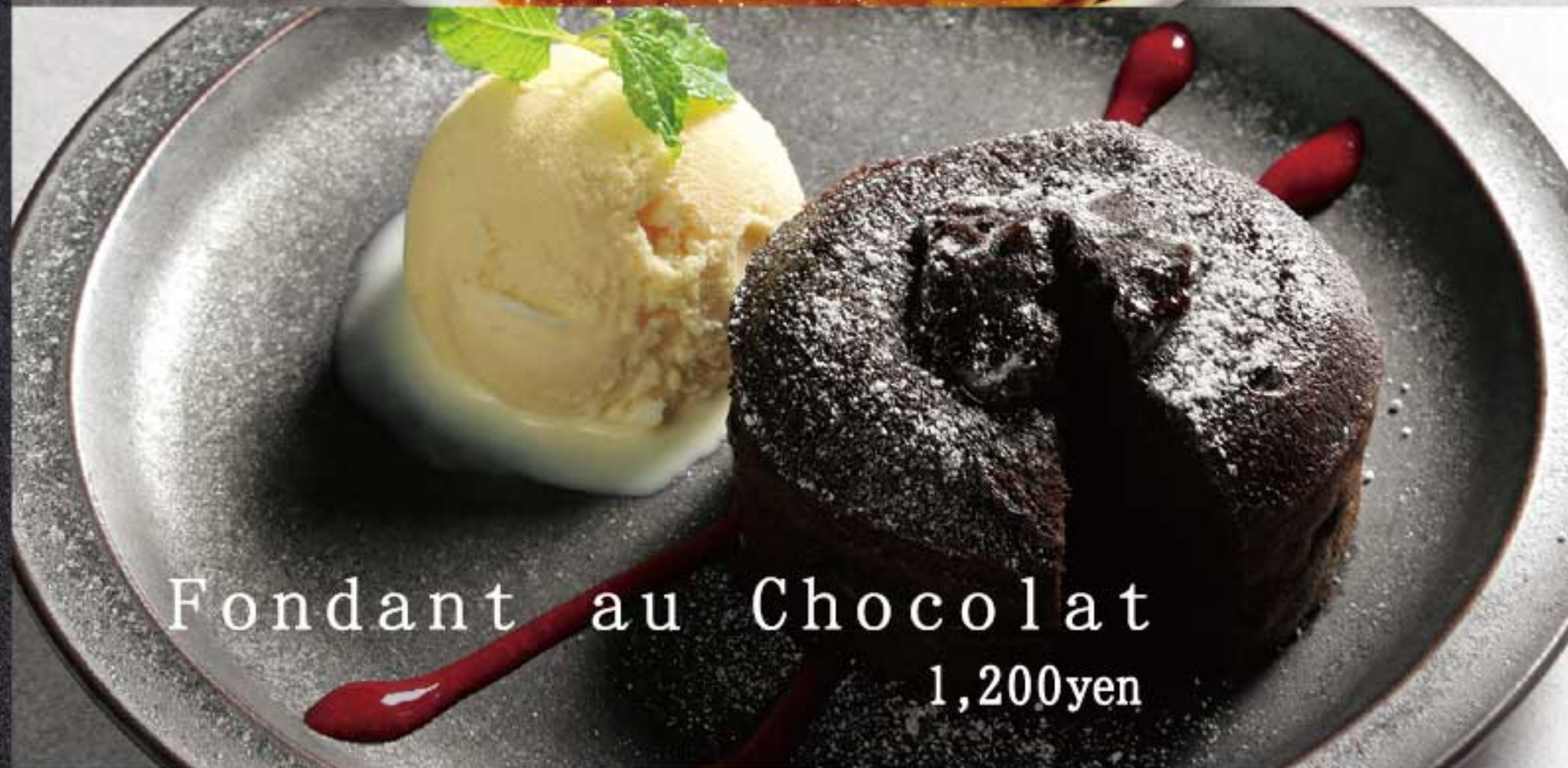
Fondant au Chocolat 1,200yen