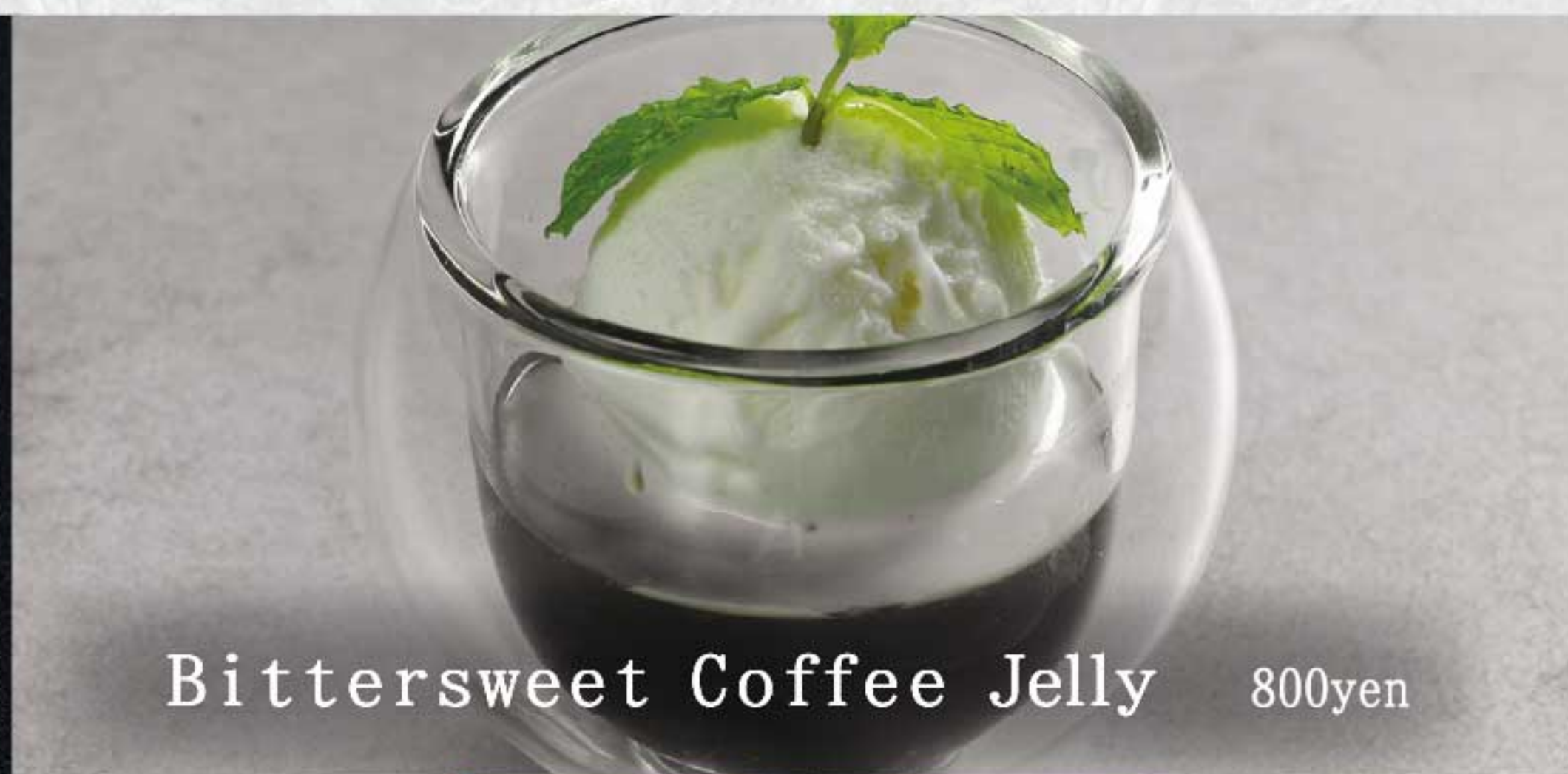
Bittersweet Coffee Jelly 800yen