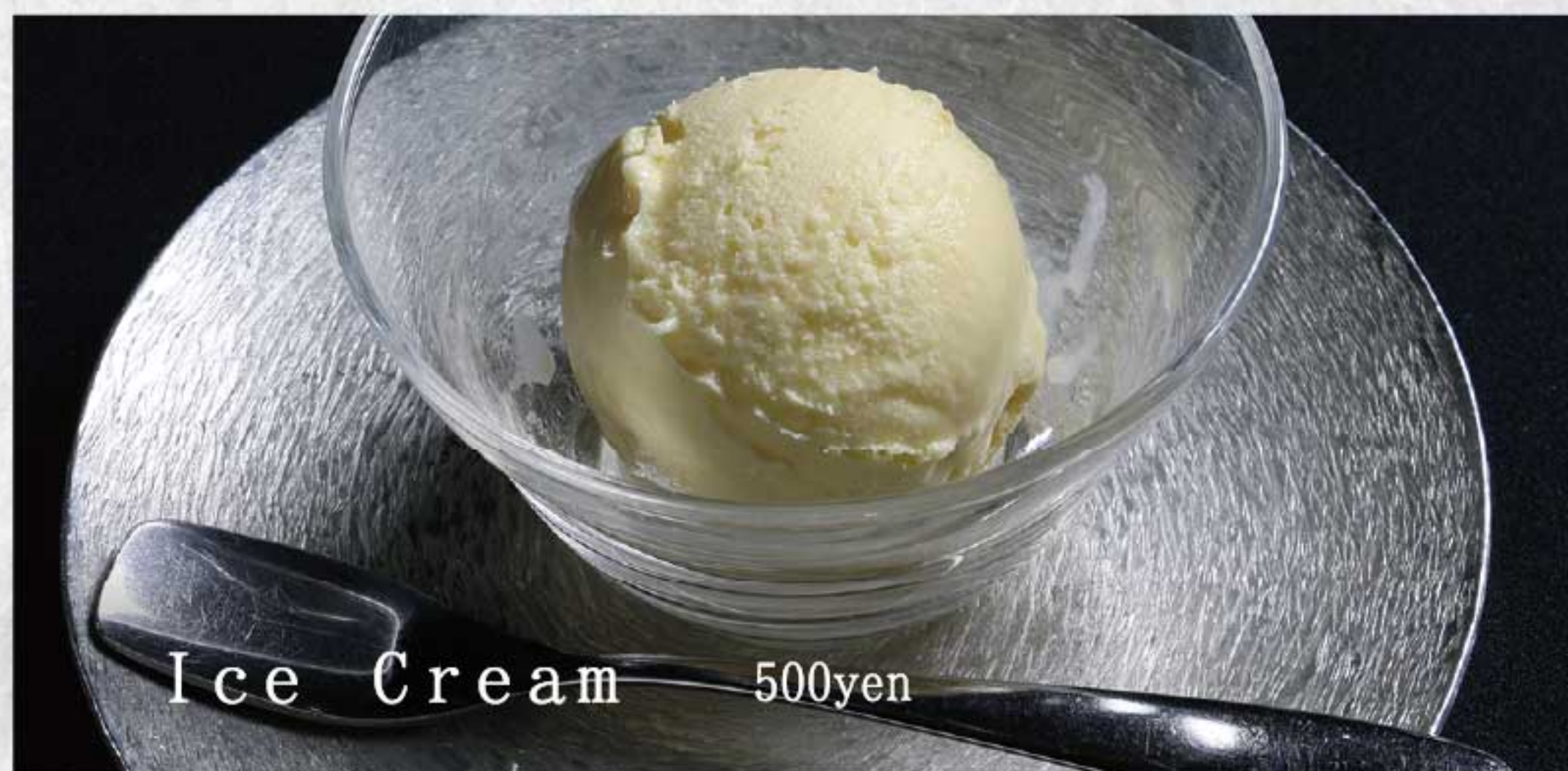
Ice Cream 500yen