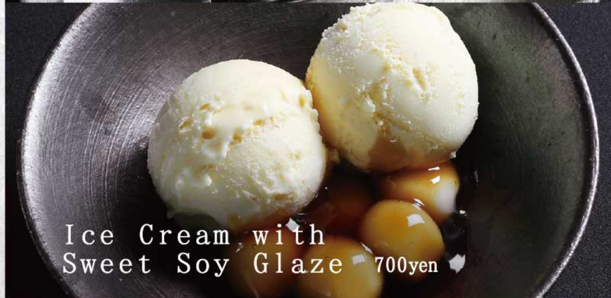
Ice Cream with Sweet Soy Glaze 700yen