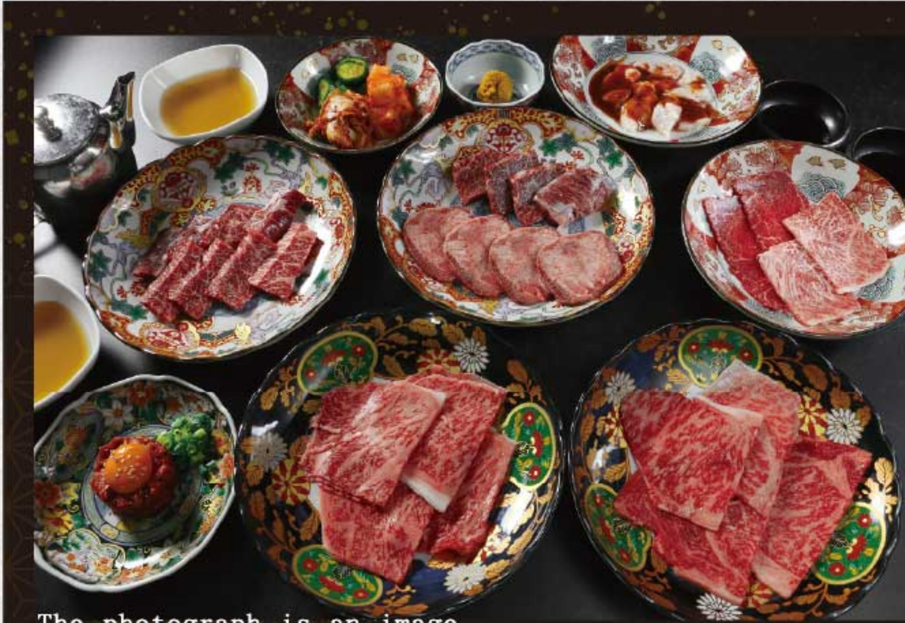
The photograph is an image.

If you would like to order a banquet course, please contact our staff.