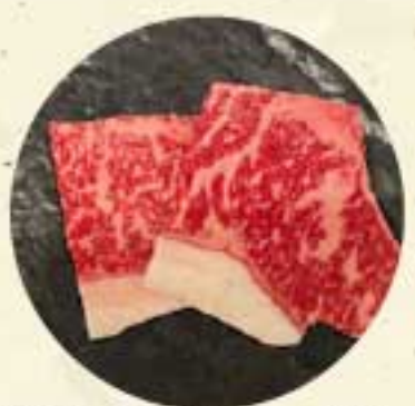
High Quality Loin 850yen