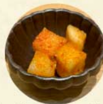
Daikon Radish Kimuchi