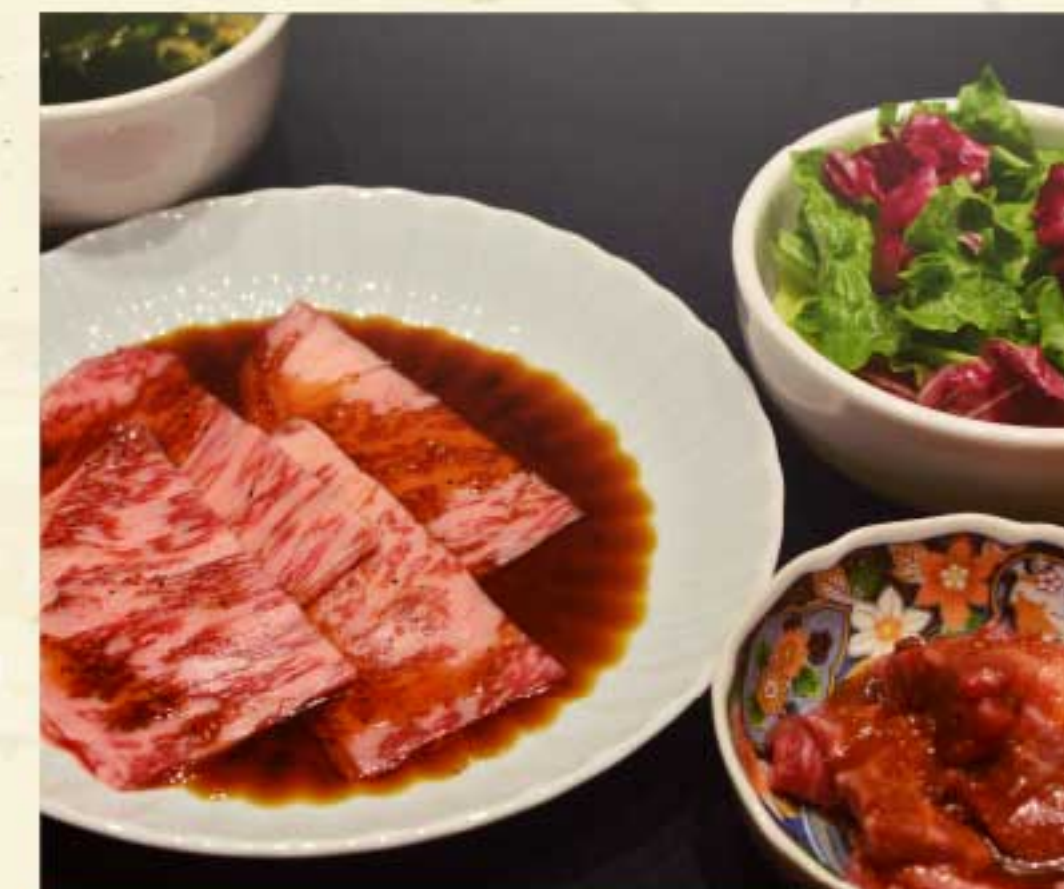
Mille-feuille Loin & Cut-offs Lunch 2,900yen