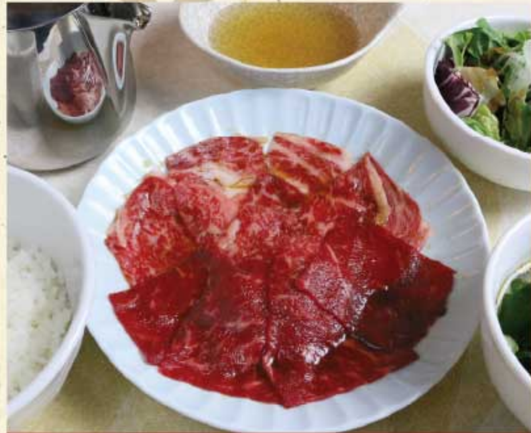
Thinly sliced meat lunch 1,600yen