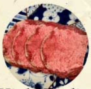
High Quality Salted Tongue 1,050yen