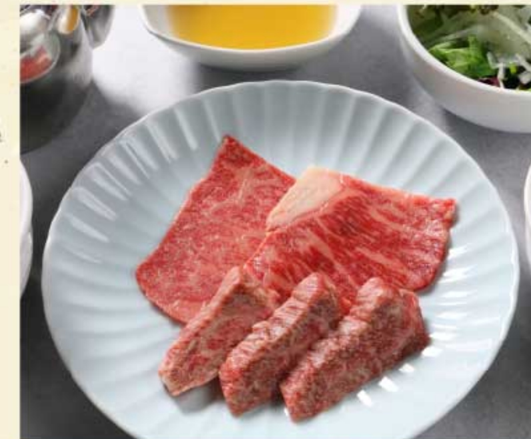
High Quality Loin Short Ribs Lunch 1,750yen

Additional a la carte menu 250yen each ※Small bowl size for lunch