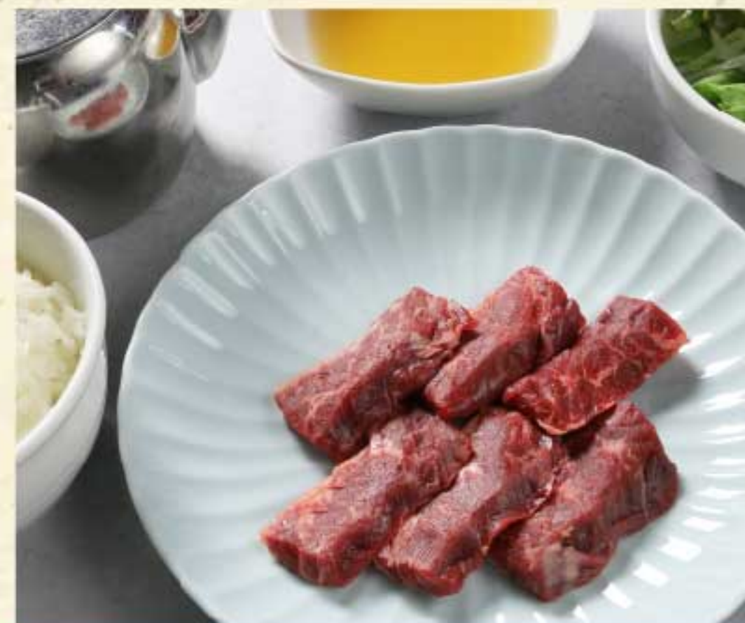
Outside Skirt Lunch 1,750yen