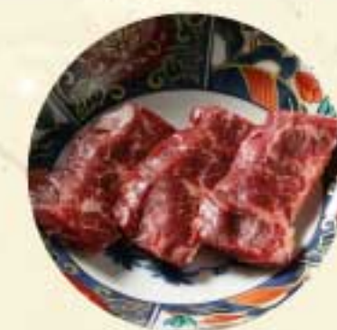
Outside Skirt 850yen