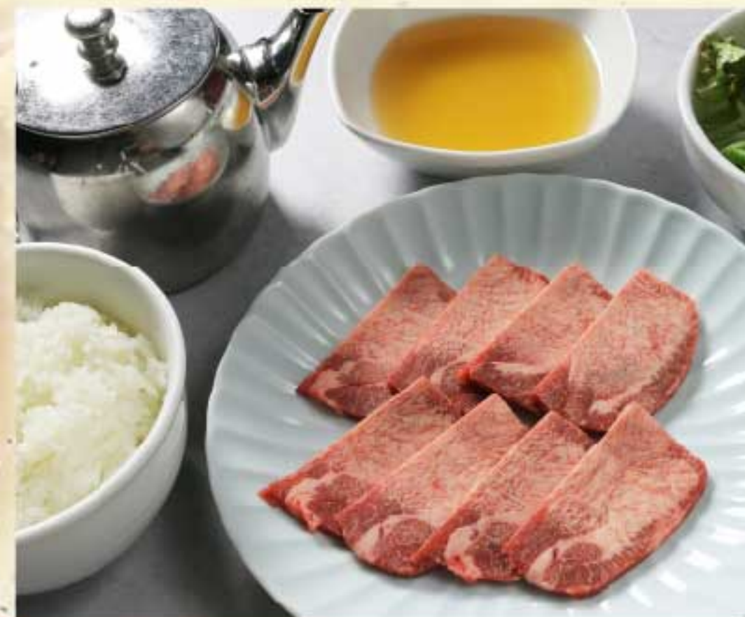
High Quality Tongue Lunch 2,150yen