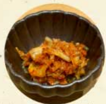
Chinese Cabbage Kimuchi

Additional a la carte menu 250yen each ※Small bowl size for lunch