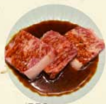
Wagyu Short Ribs 850yen