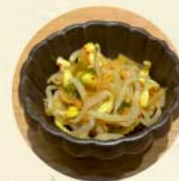
Bean Sprouts Namul